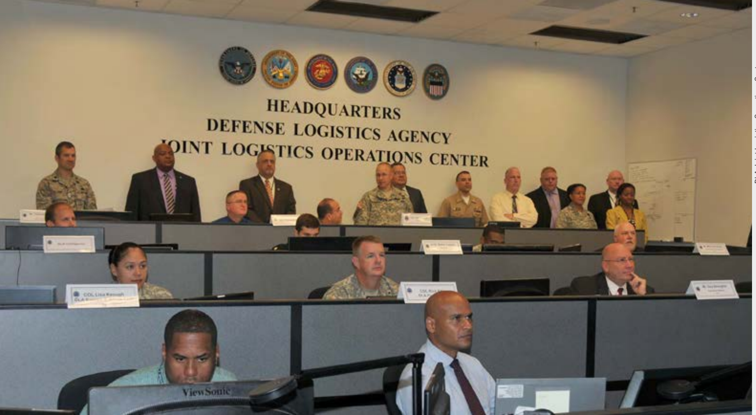
DLA Joint Logistics Operations Center