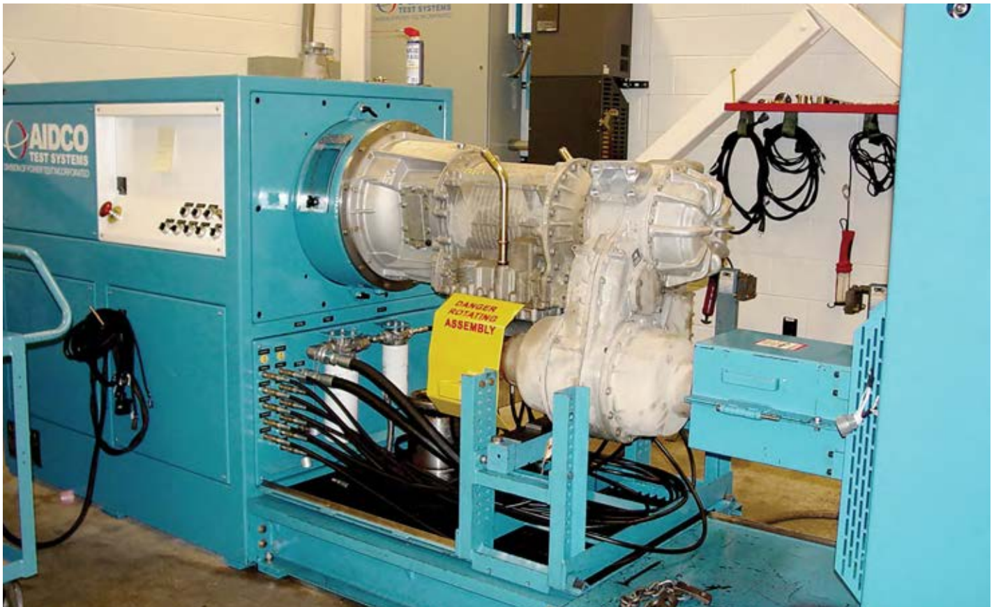
The Ohio Army National Guard's Combined Support Maintenance Shop at Defense Supply Center Columbus tested the “hybrid” with their transmission dynamometer. The transmission subassembly is mounted on the dynamometer, and technicians use a short lever to shift gears between park, reverse, neutral and drive. Other connections allow control and data signals to pass between the control console and the transmission.

By analyzing and developing a process management solution that consolidated, standardized, and integrated the total DoD supply chain, DLA Land and Maritime realized savings, avoided costs and improved warfighter support all at once. 🌟